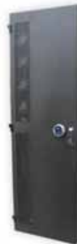
Class B door with 4 high speed fan insert (top) and mesh insert (bottom)