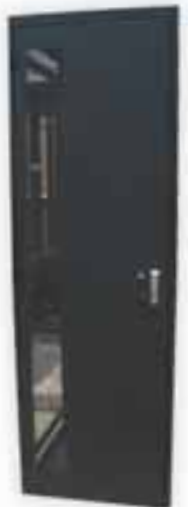
Class C door with mesh inserts