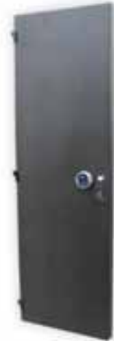
Class B Solid steel door