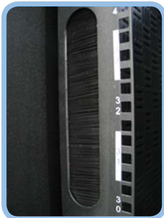
Mounting Rails with cable apertures and brushes (800mm wide racks)