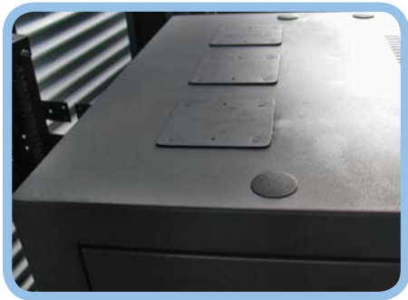
Cable entries top