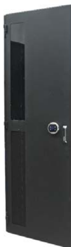
Class B door with a polycarbonate insert (top) and mesh insert (bottom).