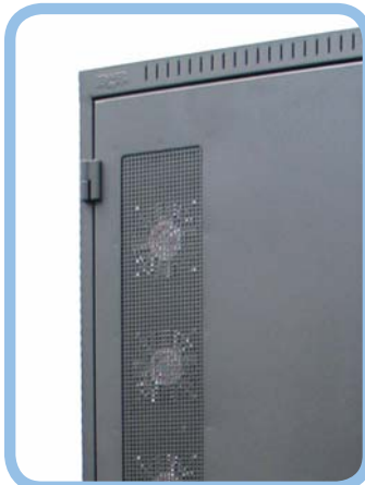
Door showing high speed fan insert