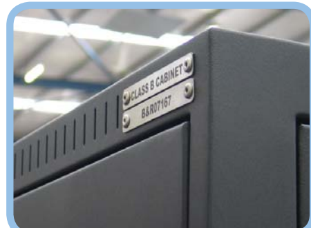
Nameplate with rack serial number