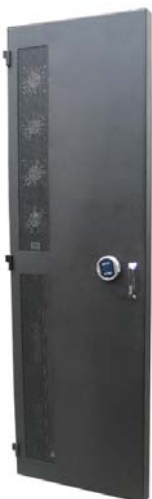
Class B door with a 4 high speed fan insert (top) and mesh insert (bottom).