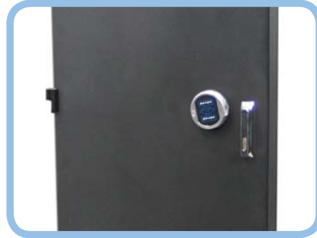
Class B door